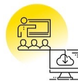
Hybrid A combination of scheduled on-campus meetings and online class work.