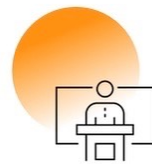
On Campus 100% in-person class.